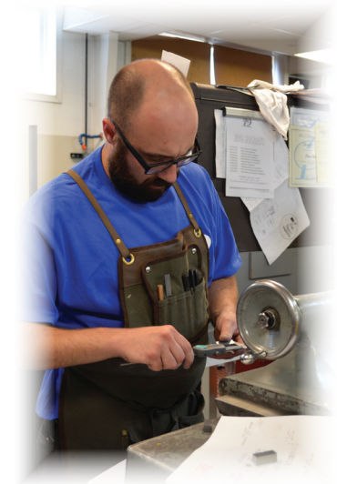
Dorsey Products - proudly made in the USA