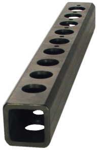
1.5" x 1.5" Heavy Duty tube 3.5 lbs per ft.