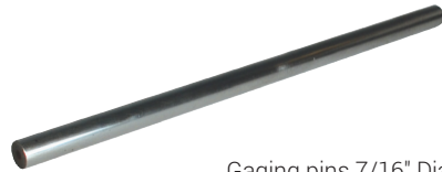
Gaging pins 7/16" Dia.