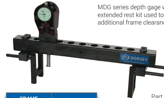
Part # MDGRK2 Rest kit, 2" Tall

MDG series depth gage with optional extended rest kit used to provide additional frame clearance