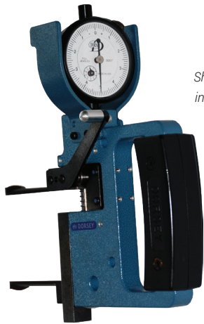
Shown with 2DM125-05 dial indicator. .0005" graduation.