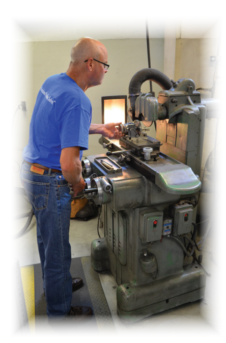
Dorsey Products - proudly made in the USA