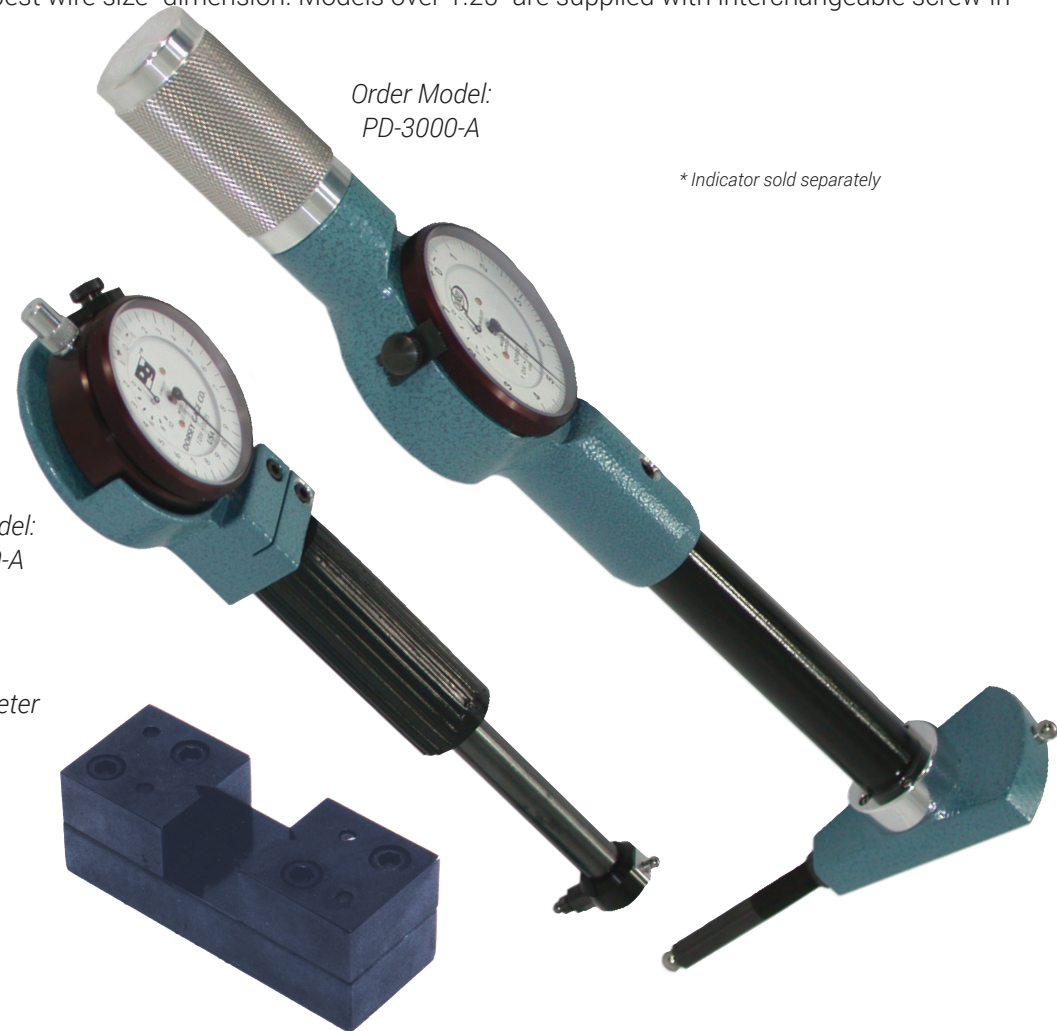
Order Model: PD-3000-A

"V" Style pitch diameter setmaster, built per application