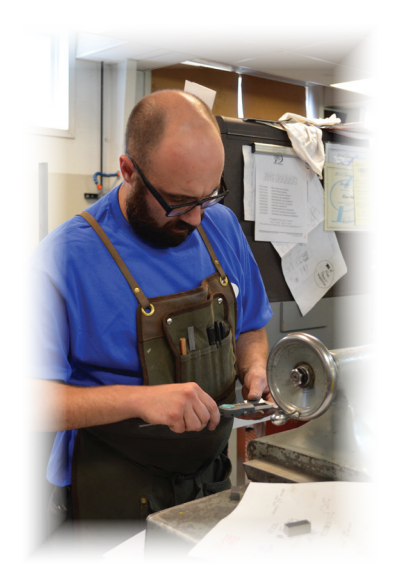
Dorsey Products proudly made in the USA