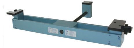
Outtrigger assembly for SMF or SSM series masters.