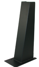
Part# 4394 (used on SMA) Part# 4395 (used on SSM) Up to 36"

Recommended if gage is used in vertical position